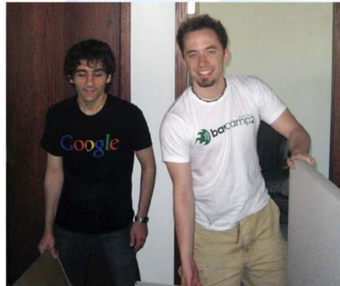
Moving into our first office, 5/14/07